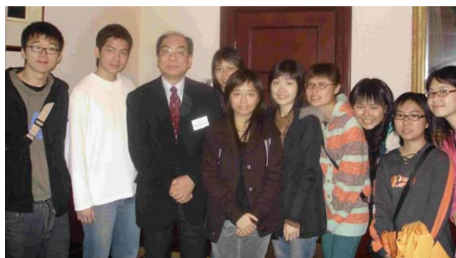
Below: The “PolyU 7” group pictured here with some of the PolyU Exec. Committee Members at Bosco’s home in Sydney