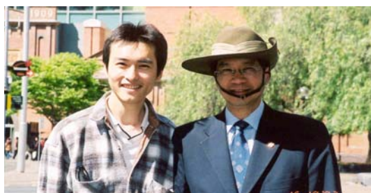
筆者(左)與 潘宗光校長 在 2003 年一 張難忘合照