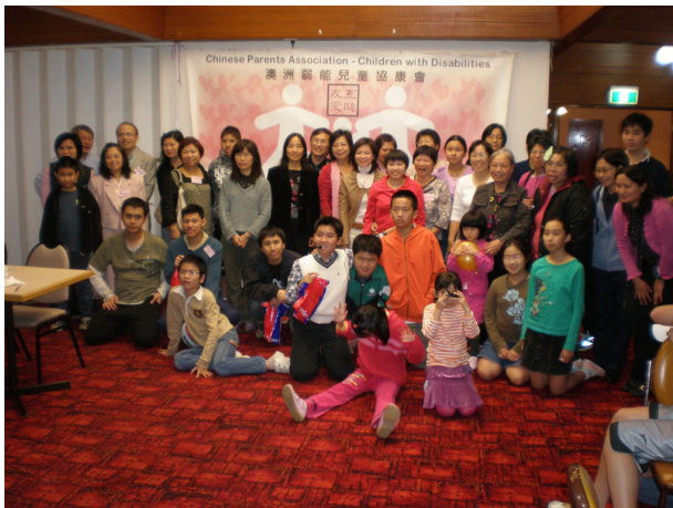
Group picture with CPA committee, parents, children and guests

CPA is a charitable organisation and has been setup for nearly 20 years from 1988. For more understanding of the association, please visit http://www.communilink.org.au/chineseparents .