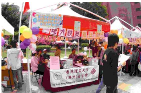
Our booth at the PolyU Alumni Homecoming Carnival 2004