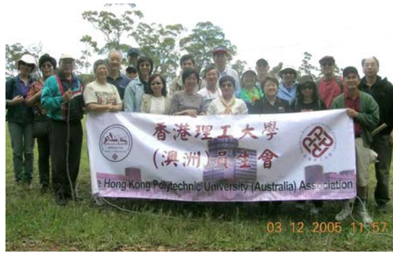
Above Left: Melbourne members united for a Christmas yum-cha at the Plume Restaurant, Doncaster on 17 December 2005; Right: 65 participants (members and their friends) enjoyed a one day country visit at the Fern Valley Ranch (鳳尾谷，又稱快活谷) in Somersby, Gosford on 3 December 2005. .